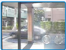
Normal Wide Dynamic Camera

Fast moving objects can be captured under low light conditions.